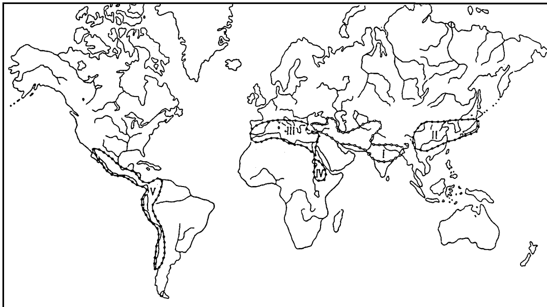
Figure 1: Centers of Origin of Crops

Key: I. Southwestern Asia; II. Eastern Asia; III. the Mediterranean area; IV. Abyssinia and Egypt; V. mountainous areas of Mexico, Central America, and South America.